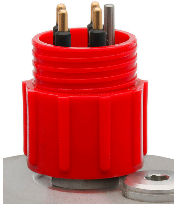
Subconn® Circular connector

In case a Subconn® Circular connector is selected, the sensor can be supplied with custom-made cabling in a variety of lengths, allowable loads, and connector types.