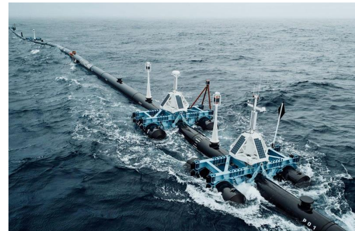
Figure 2 In 2018 Seatools successfully delivered a remote offshore monitoring system for the Ocean Cleanup. Based on the same technology elements CALM buoy monitoring can be performed.