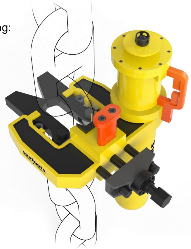
Figure 1 Impression of a subsea measurement unit.